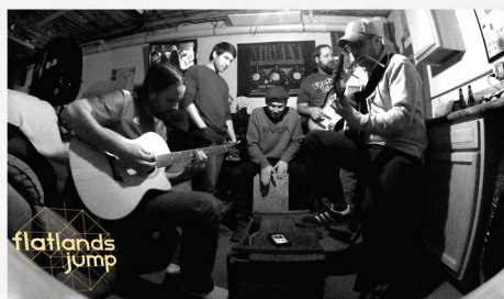
She Caught the Katie (Cover)