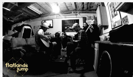
You Lost Me (Acoustic)