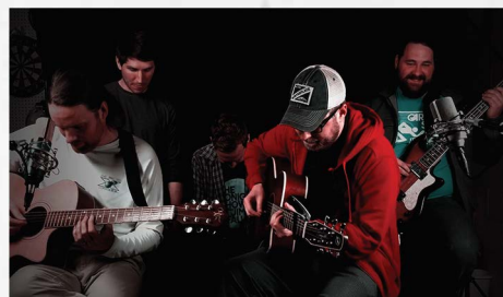
Highway Song (Acoustic)